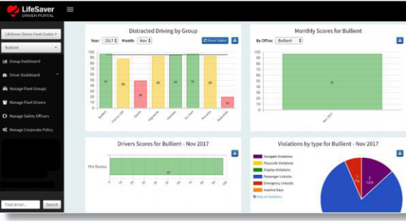
Fleet Management Dashboard